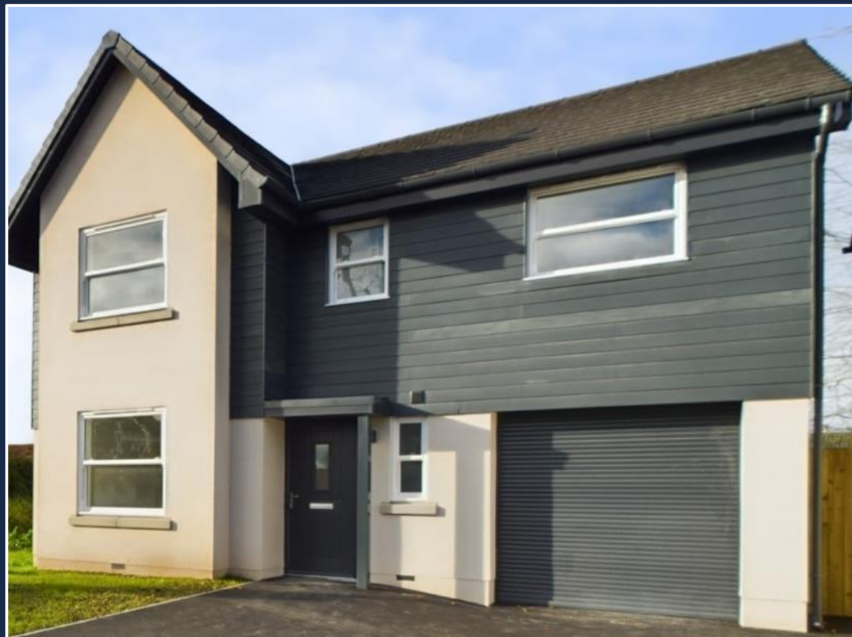
The Magnolias, 5 Ham Mews, Old Bristol Road, East Brent, Somerset, TA9 4HX